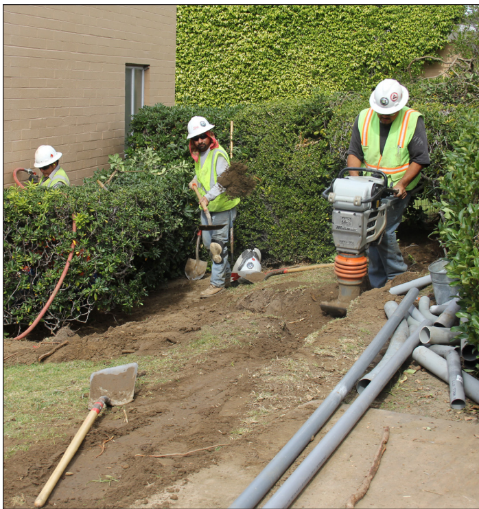
Crew members dig customer services trenches, install electrical conduit and fill in trench work.

Cabling involves technicians placing new utility lines in the new conduits, so that the new lines can be “energized” and brought into service. Once the new system has been energized, the process to “cut-over” customers from overhead to underground services will begin. Once customers have been cut-over, the overhead lines will be removed. This process is not nearly as disruptive as the trenching work, which is why you may not even see us working. A door hanger will be left prior to the contractor visiting your property.